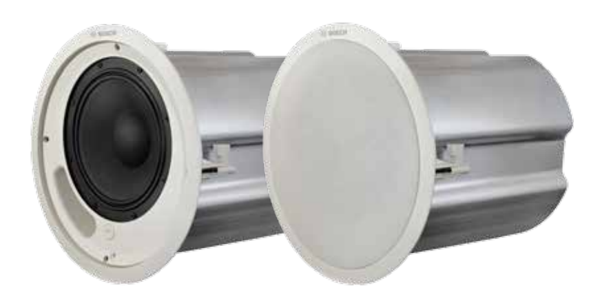
(front, grille off)

High-quality audio with acoustically balanced crossover point eliminates localized sub effect so system sonically 'disappears.'